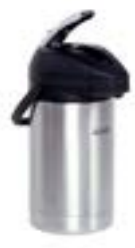
AIRPOT, 3.0L SST LA 6/ CASE