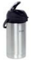
AIRPOT, 3.8L SST LA 6/ CASE