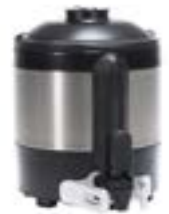
TF SERVER, 1G MECH GEN3 NOBASE