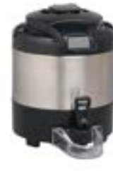
TF SERVER, DSG2 1G SST NOBASE