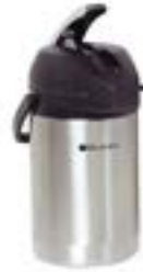
AIRPOT, 2.5L SST LA 6/ CASE