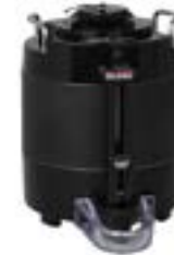
TF SERVER, 1G/3.8L MECH BLK NOBASE