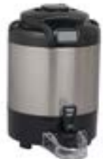
TF SERVER, DSG2 1.5G SST NOBAS