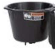
FUNNEL ASSY, SMART COFFEE BLK-CLEARED