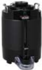
TF SERVER, 1.5G/5.7L MECH BLK NOBASE