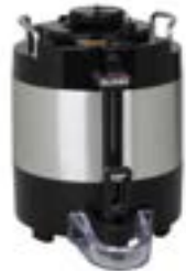
TF SERVER, 1G/3.8L MECH NOBASE