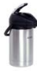
AIRPOT, 3.0L SST LA SINGLE PK