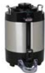
TF SERVER, 1.5G/5.7L MECH NOBASE