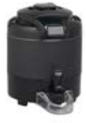
TF SERVER, DSG2 1G BLK NOBASE