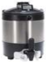
TF SERVER, 1G DSG GEN3 NOBASE