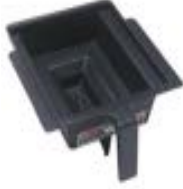
FUNNEL W/DECAL,PPK NAR BLK(LG)