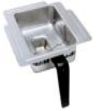
FUNNEL ASSY, SST-PP BLK HDL