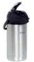
AIRPOT, 3.8L SST LA SINGLE PK