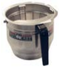
FUNNEL AY,W/DECAL GRT "C"7.12