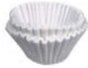
FILTERS,REGULAR1M 500/2 50/CL