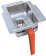
FUNNEL ASSY,SST-PP ORANGE HDL