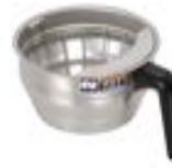
FUNNEL ASSY, SST-BLK HDL(7.12)