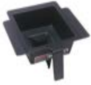
FUNNEL W/DECAL,PPK NAR BLK(SM)